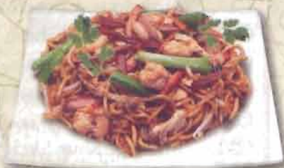
House Special Lo Mein