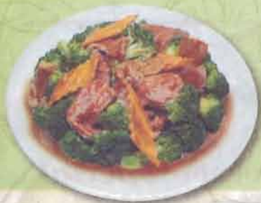
Beef w. Broccoli