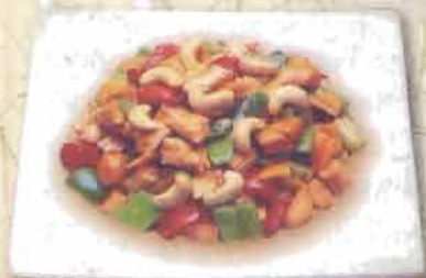
Chicken w. Cashew Nuts